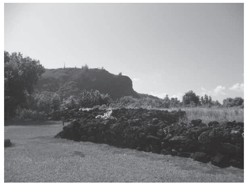
FIGURE 8 The eastern face of Poli'ahu Heiau, Kuamo'oloaokāne Ridge, Wailua, Kaua'i, with Mauna Kapu, the northern side of Kālepa mountain range in the distance