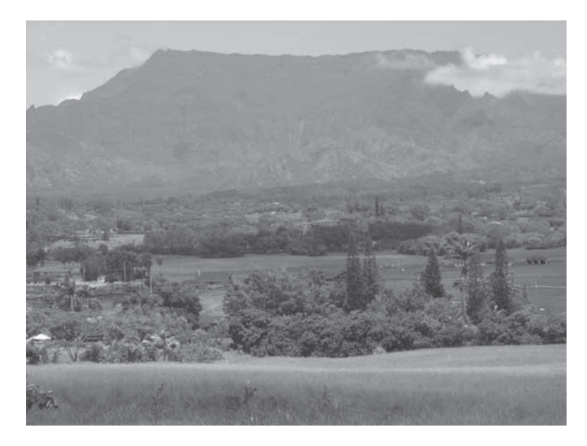
FIGURE 1 East face of Wai'ale'ale from the back of Nounou, showing Kaipuha'a (Wailua Homesteads area) today