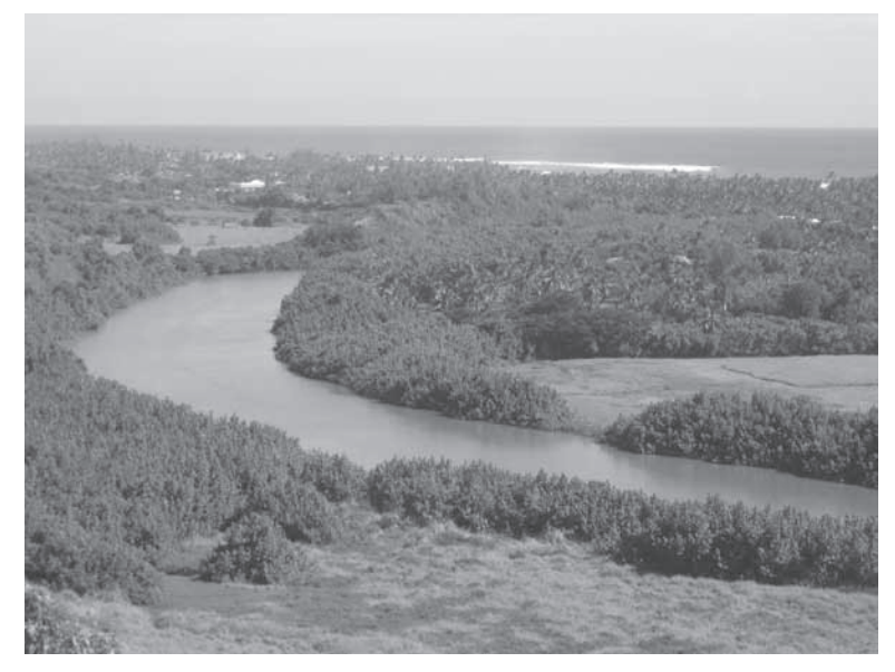
FIGURE 3 A view of Wailua River looking ma kai (toward the sea), taken from Kuamoʻoloaokāne Ridge