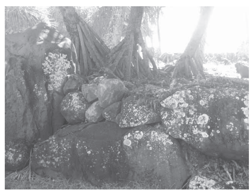
FIGURE 5 Hoʻokupu laid on põhaku at Hauola, Hikinaakalā Heiau, Wailua, Kauaʻi

Maoli cultural practitioners continue to utilize the heiau and offer hoʻokupu (ceremonial gifts), as seen in Figure 5. Hauola, considered a puʻuhonua (place of refuge), is located within the boundaries of Hikinaakalā.<sup>32</sup> It was a place of refuge in traditional times during warfare and for those who broke kapu (taboo). After performing certain rituals, refuge-seekers were allowed to leave after several days (Joesting, 1984, p. 10). A pōhaku piko (umbilical cord stone) is located here, but no pōhaku hoʻohānau (birthing stone). Hikinaakalā is the beginning of what has been called the "King's Highway" which leads from the mouth of the river up the north fork to the summit of Waiʻaleʻale. The beginning of this pathway follows the course of the river before winding upward along Kuamoʻo ridge. Today the main thoroughfare into Kaipuhaʻa is named Kuamoʻo Road, which is appropriate since kuamoʻo also means road or path.